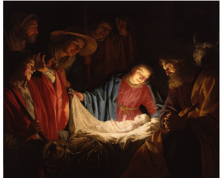
'Adoration of the shepherds', by Gerard van Honthorst.

Parish of S Alphage, Burnt Oak [Hendon] with S Augustine, Grahame Park. www.stalphage.org